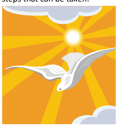
Step # 1 – Put yourself back into the

This is where the "LAMAD" approach to healing vision comes into play. The Christian knows his or her painful past memory only too well. Above all you want a divine perspective on it. So it is suggested that you use the first three of the four keys to help the your self to come to stillness; ready to receive spontaneous vision from the "Spirit of Jesus". There are simple steps that can be taken: